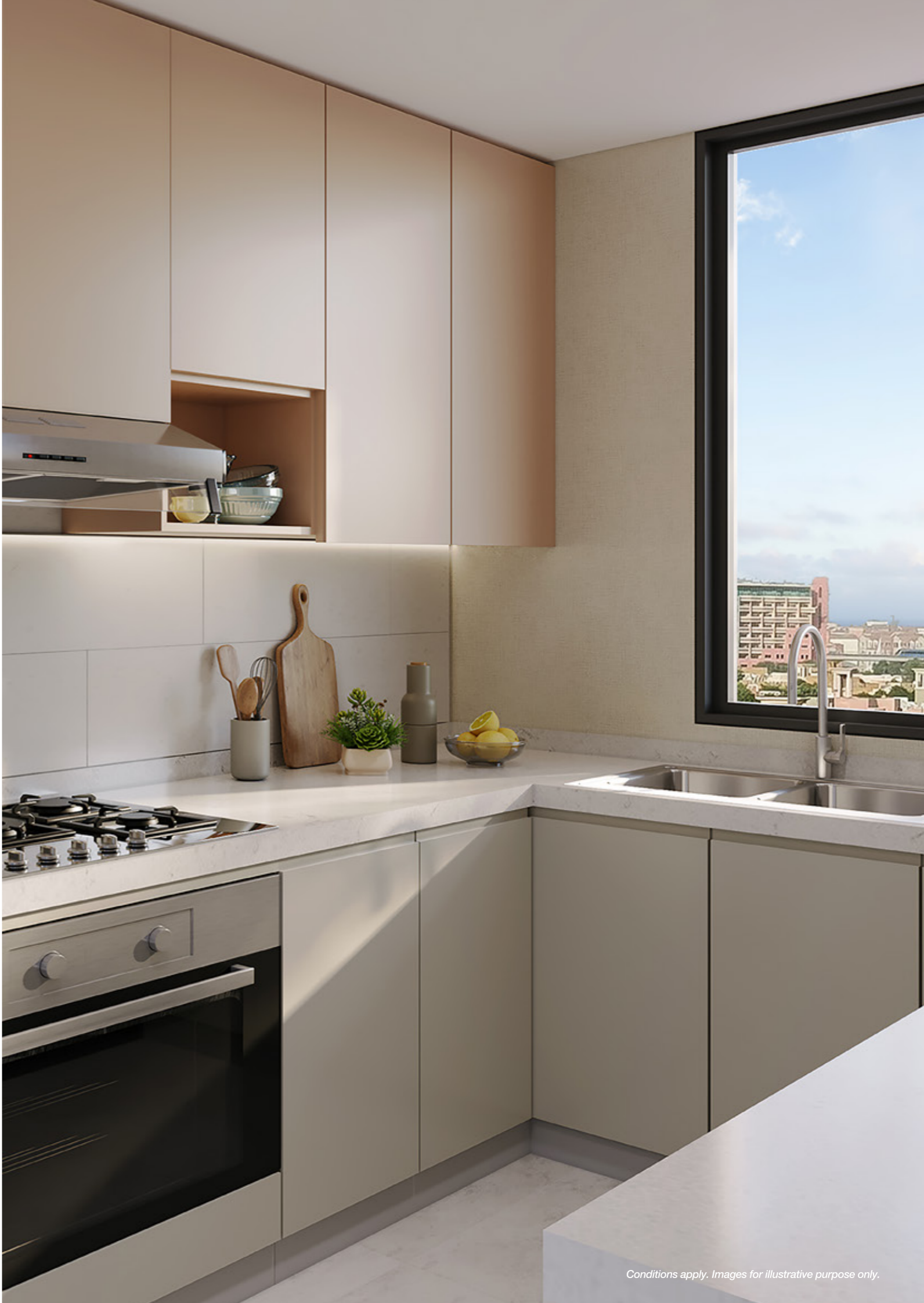
Conditions apply. Images for illustrative purpose only.

*Payment plan is 40-60 for all units, except for 1 BHK units, which follow the 50-50 payment plan. Prices and payment plans are subject to change.